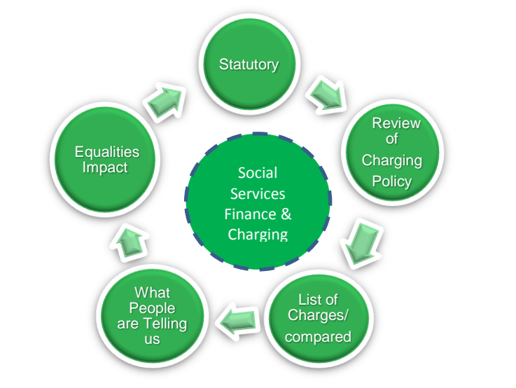
Figure 1.Swansea Model for Annual review of charging (social services)

2.3 Our Annual Review model is based on Wales Audit Office best practice for reviewing charging ,to ensure that Swansea's charging policy continues to be based on strong principles of fairness and equality, to support Council's approach to achieve full cost recovery and transparency in how it is being implemented.